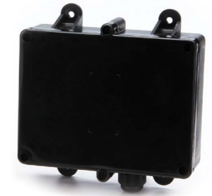
Standard Relays Functions: 2 / 4*