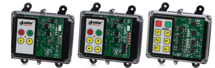
NEW Standard FETS Keypad Functions: 2* / 4* / 6*