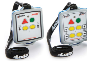
Mini Functions: 2 / 4