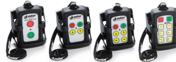
Standard Functions: 1 / 2 / 4 / 6