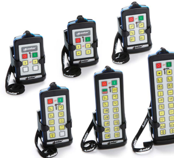
IP Functions: 2 / 4 / 6 / 10 / 16 / 20