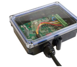
Mini FETS Functions: 2