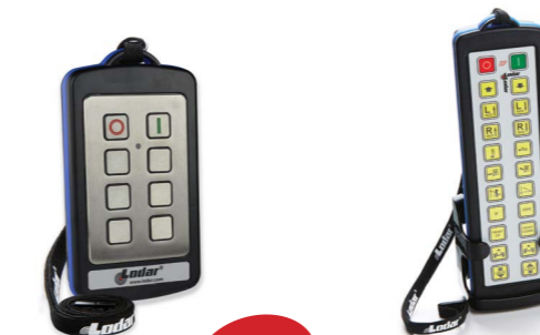
Stainless Functions: 2 / 4 / 6