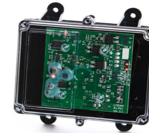
Standard FETS Functions: 1 / 2* / 4 / 6