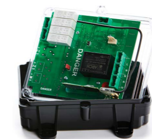
Standard Relays Functions: 2* / 4*