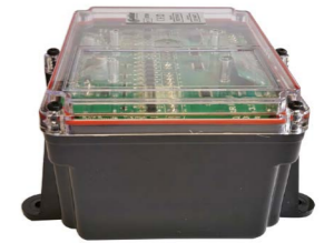
Deep FETS Functions: 10 / 16 / 20*